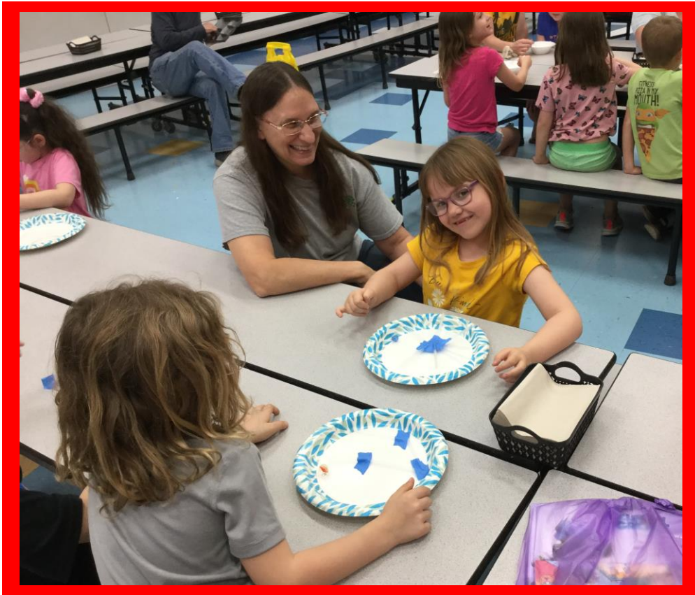
K-1 students created their own maze.