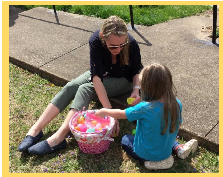
Family members were on hand to help open eggs and see the surprises that waited inside.