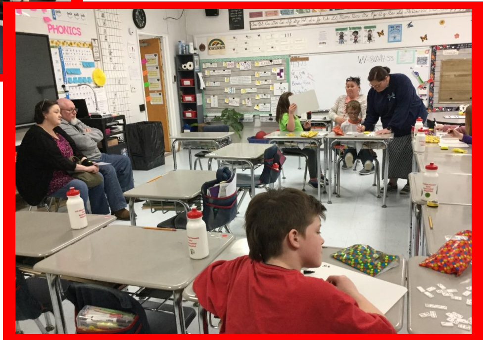
Students in 2 nd and 3 rd grade were joined by family members to play math games.