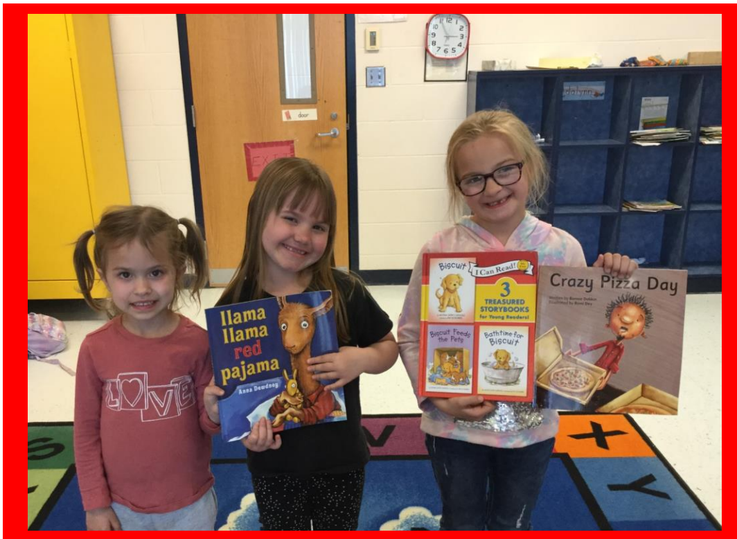
Reading time is important time, and I was fortunate enough to have these three young ladies each read a book to me.