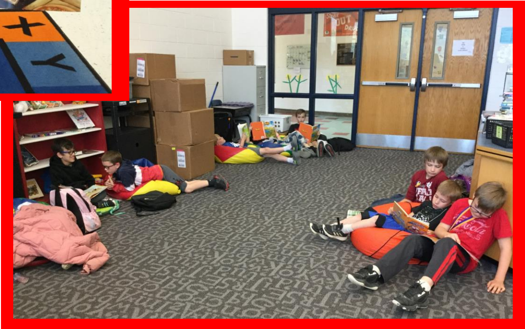
These 3 rd grade students know being comfortable is key to good reading.