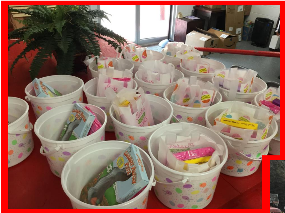
Buckets filled with bags of goodies awaited students participating in the Easter egg hunt.