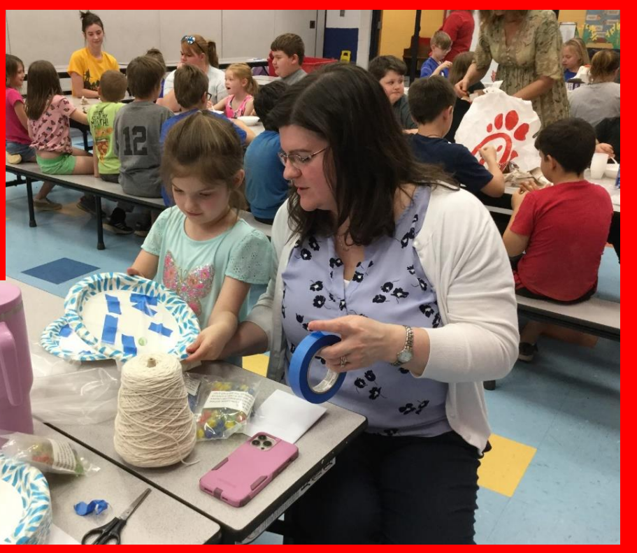
Parents helped them test their work, seeing if a marble could pass through the maze.