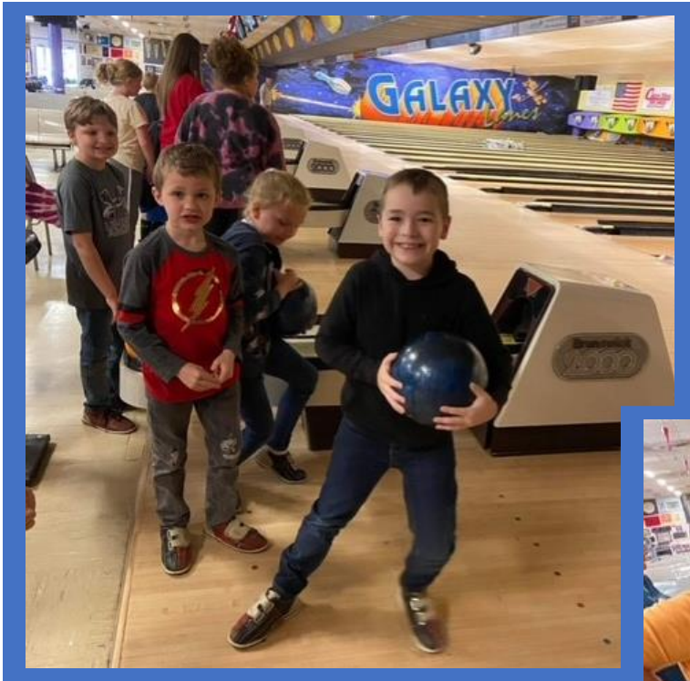
Students who attended 90+ hours were treated to a trip to Galaxy Lanes in Kanawha City.