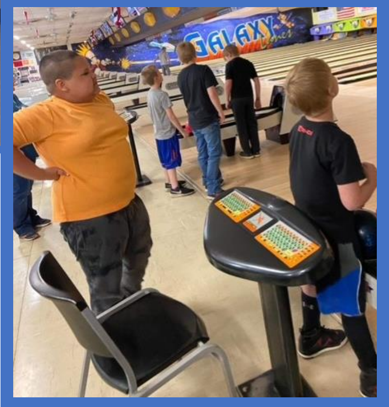
Knowing how to keep score is an important part of bowling.