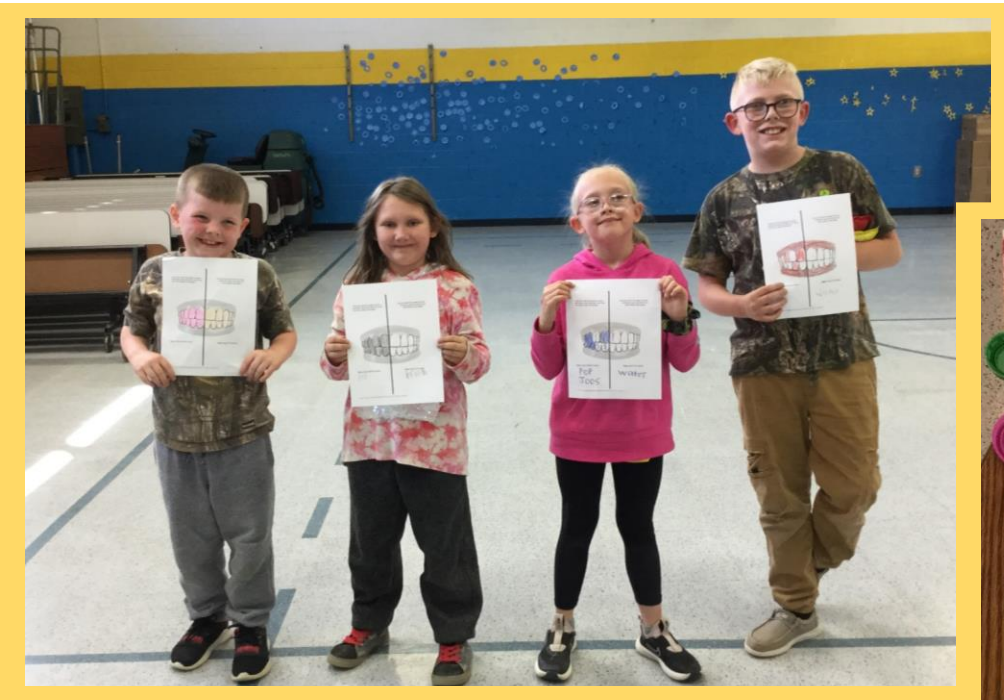
2 nd and 3 rd grade students share what they learned about dental health during Healthy Choices.