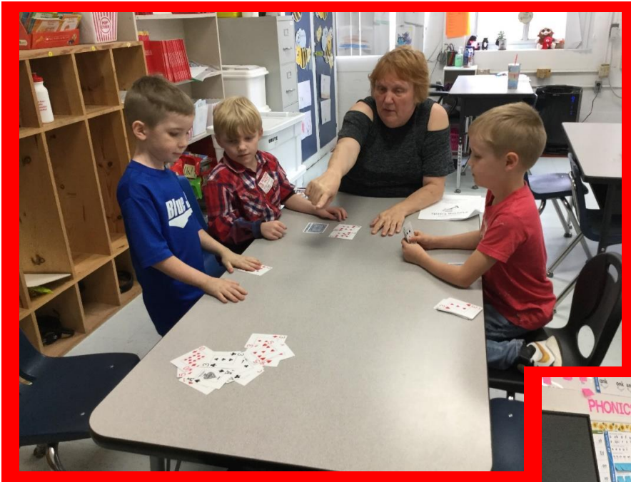
K-1 students learned how playing cards could reinforce math skills.