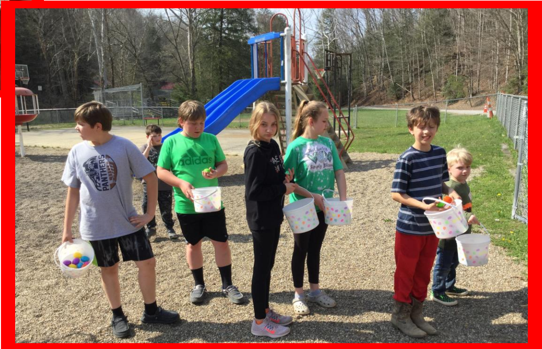
After searching the playground, these students show off their finds.